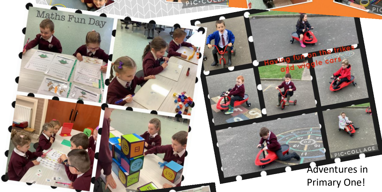
Adventures in Primary One!